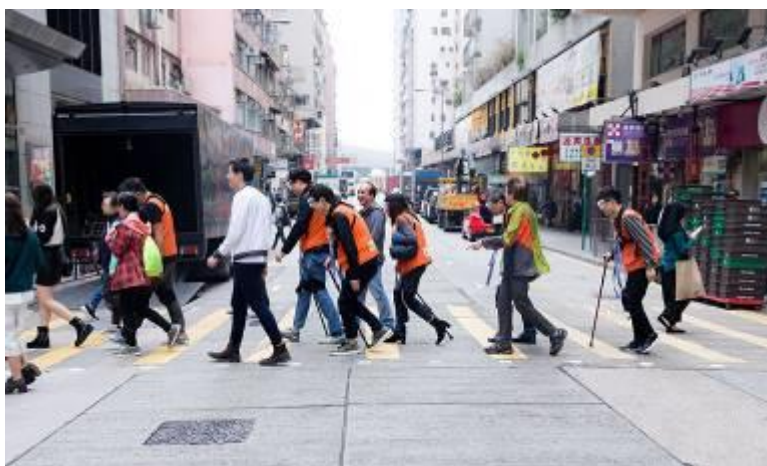
(Picture 9) "I gained a better understanding of the stress when the aged crossing the road, I could not walk faster but the vehicles were already arriving." a participant said.