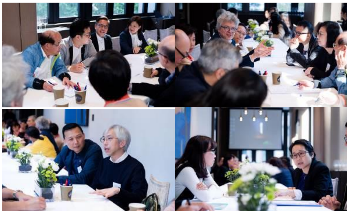
(Picture 16-19) The professional forum held in afternoon section, approximately 40 invited participants were reflecting how our urban design can be more inclusive and to enable the elderly to stay active and remain healthy.