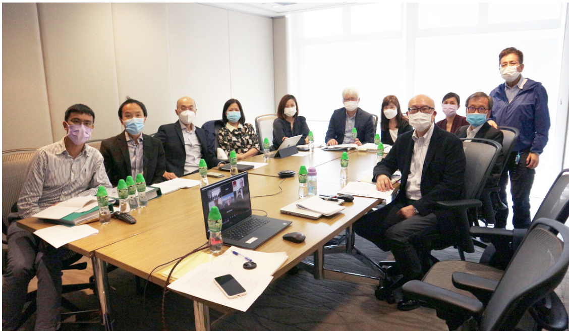
CEDD HKIUD Hybrid Meeting on Lantau Tomorrow Vision on 22 April 2021