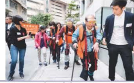
Experiential Workshop (17 Mar 2018)