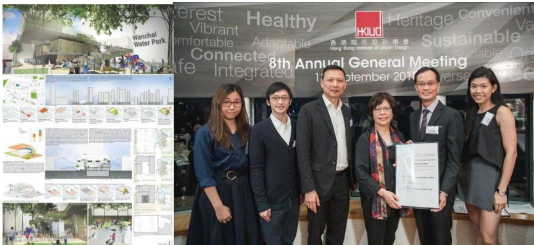
Special Citation for Plan/Concept Category (Local Projects) - Singular Studio Limited for the design of 'WanChai Water Park'