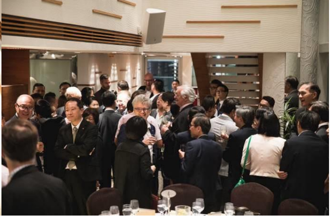
8 th Annual Dinner