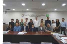
Accreditation of HKU MUD (2 Jun 2018)