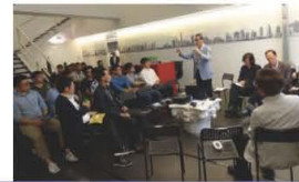
HKIUD + HKILA Land Supply Briefing (16 August 2018)