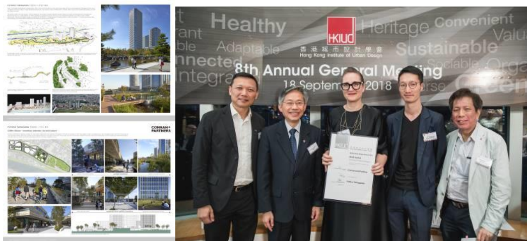
Merit Award for Built Project - Conran and Partners for the design of 'Futako Tamagawa'