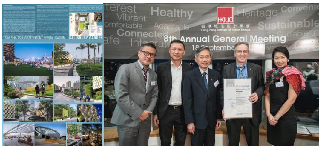
Merit Award for Built Project - Urbis Limited for the design of 'Tsim Sha Tsui Waterfront Revitalization - Salisbury Garden'