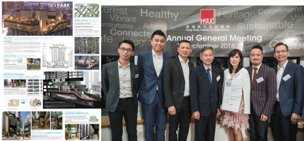
Grand Award for Built Project - P&T Architects & Engineers Ltd. for the design of 'SKYPARK'