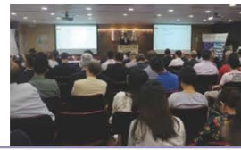
HKIUD+PGBC talk ( 9 May 2018)