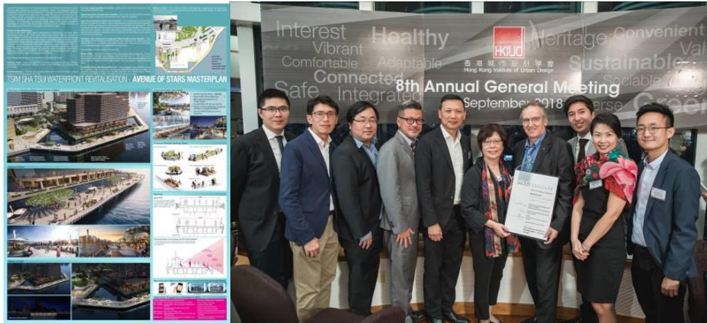
Merit Award for Plan/Concept Category (Local Projects) - Urbis Limited for the design of 'Tsim Sha Tsui Waterfront Revitalization – Avenue of Stars'