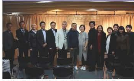
HKIUD+PGBC talk (23 Jan 2018)