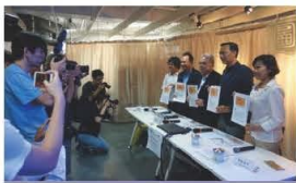
Joint Institutes Press Conference on Yuen Long Footbridge(17 July 2018)