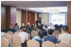
8th AGM (18 Sep 2018)