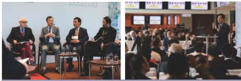
HKIUD Conference 2018 (22 Jun 2018)