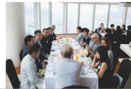
Networking Breakfast (23 Jun 2018)