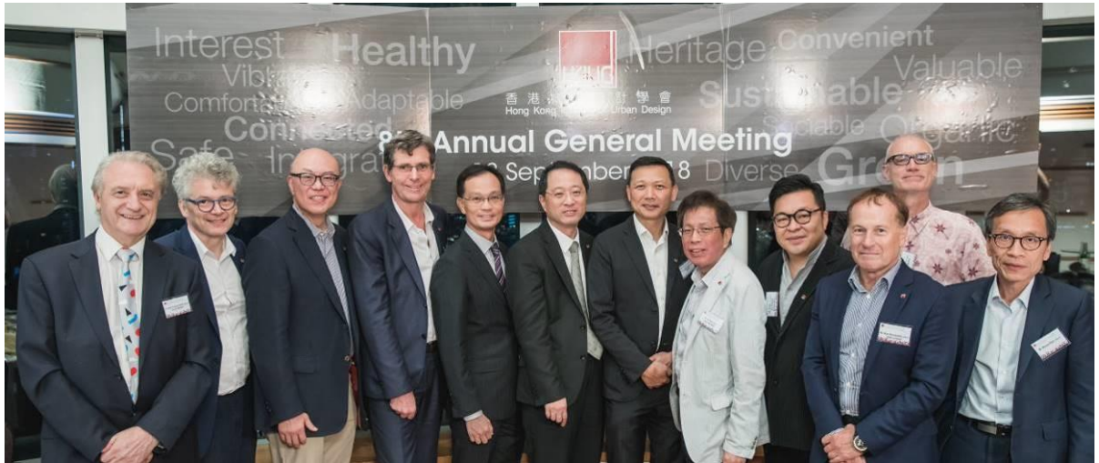
Council Members Elected (2018 – 2020)