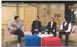
RTHK "自在8點半" (3 Apr 2018)