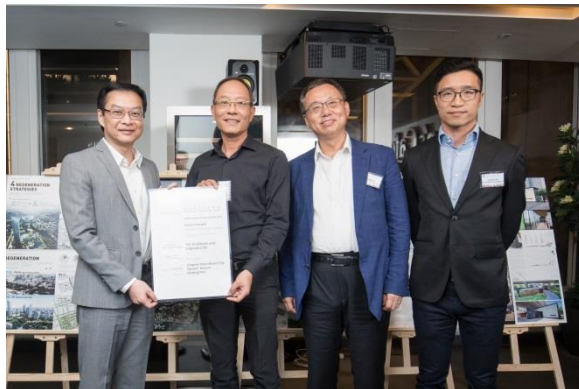
Presentation of Grand Award for Plan/Concept Category (Non-Hong Kong Projects) - P&T Architects and Engineers Ltd for the design of 'Lingnan New World City Square, Baiyun, Guangzhou'