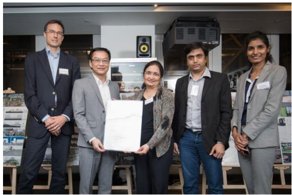
Presentation of Merit Award for Plan/Concept Category (Non-Hong Kong Projects) - UDP International for the design of 'Naya Dharavi'