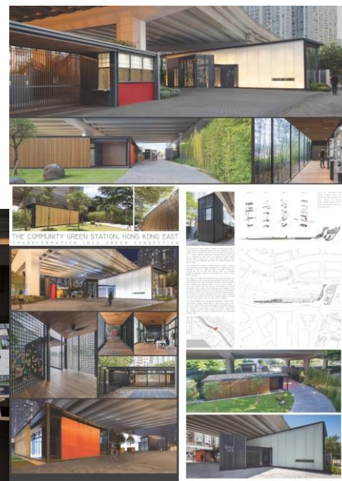
Presentation of Merit Award for Built project Category - Architectural Services Department, HKSAR Government for the design of ‘Hong Kong East Community Green Station’