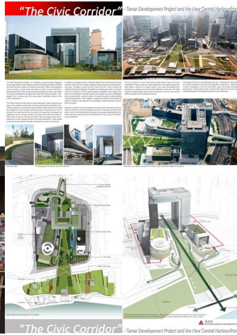
Presentation of Grand Award for Built project Category - Architectural Services Department and Rocco Design Architects Ltd. for the design of “The Civic Corridor” – Tamar Development Project and the New Central Harbourfront’.