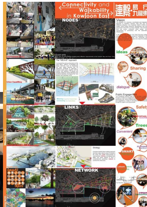
Presentation of Special Citation for Plan/Concept Category (Hong Kong Projects) - Energizing Kowloon East Office, Development Bureau, HKSAR Government and Other