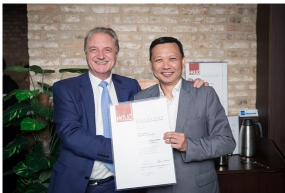
Presentation of Certificate to Corporate Affiliate: Urbis Ltd.