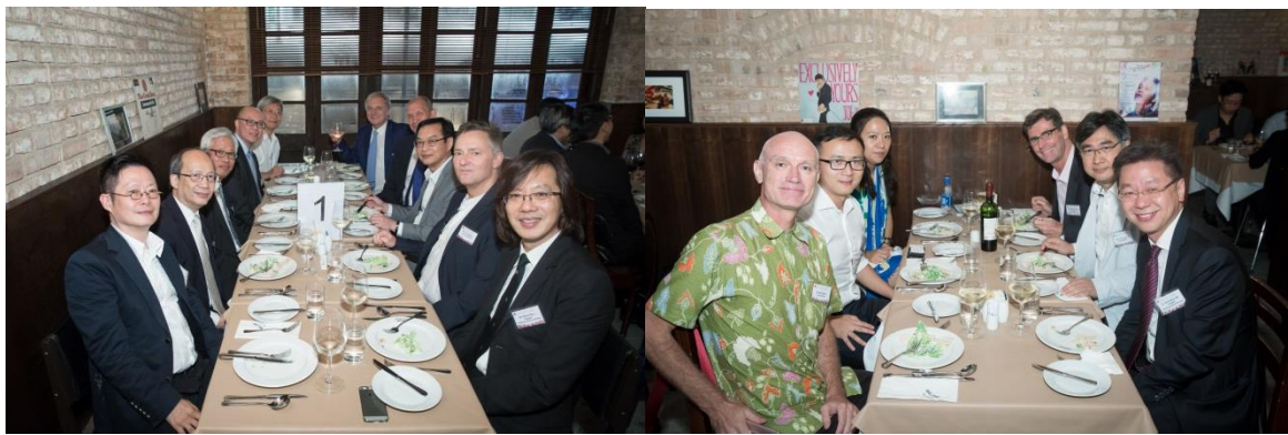
6 th Annual Dinner