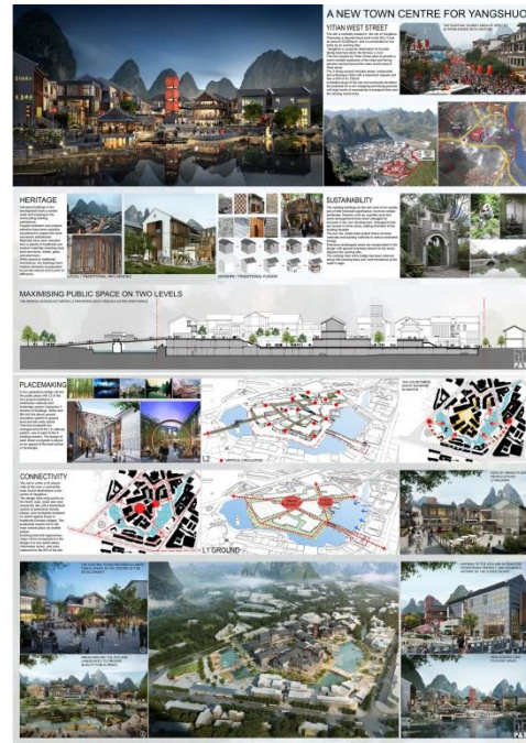
Presentation of Merit Award for Plan/Concept Category (Non-Hong Kong Projects)- P&T Architects and Engineers Ltd for the design of 'Yangshuo Yitian West St.'