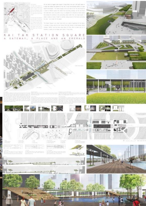
Presentation of Merit Award for Plan/Concept Category (Hong Kong Projects) - Architectural Services Department, HKSAR Government for the design of 'Kai Tak Station Square'