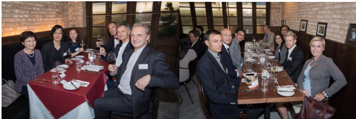
4 th Annual Dinner

Hong Kong Institute of Urban Design Limited