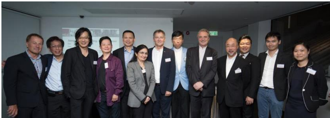
Council Members (2012 – 2014) & (2014 – 2016)

The New General Council for 2014 – 2016 of the Institute includes: