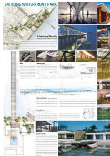
Presentation of Merit Awards for Built project Category - Architectural Services Department, HKSAR Government for the design of 'Sai Kung Waterfront Park'.