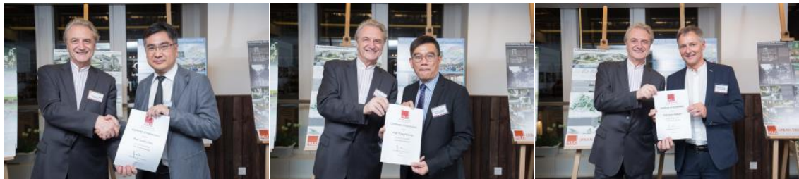
Presentation of Appreciation Certificates to Jurors of HKIUD Urban Design Awards 2014