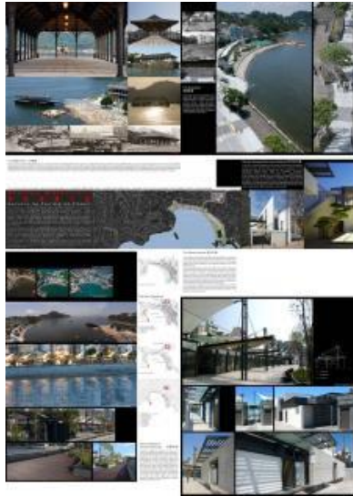
Presentation of Merit Awards for Built project Category - Architectural Services Department, HKSAR Government for the design of 'Stanley Waterfront'.