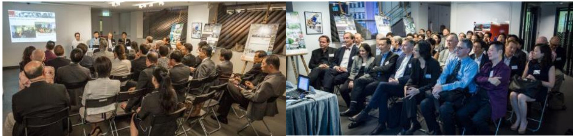
HKIUD 4 th Annual General Meeting was held on 16 September 2014.