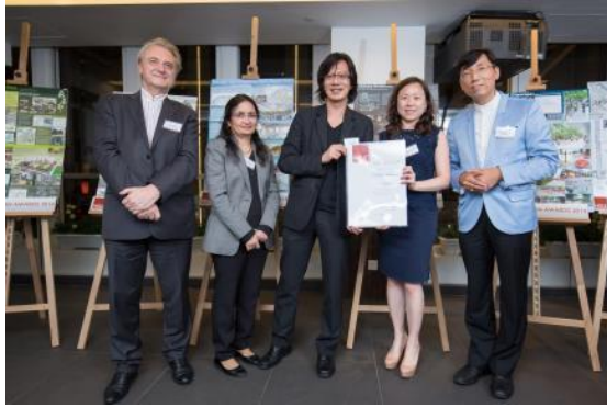
Presentation of Certificate to Corporate Affiliate: Ove Arup & Partners Hong Kong Ltd.