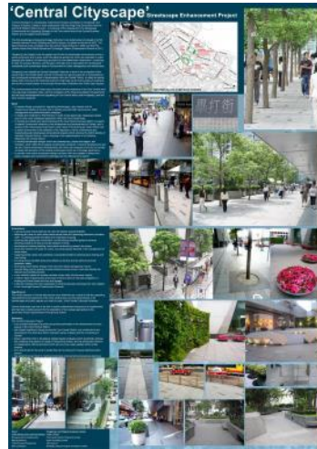
Presentation of Merit Award for Built project Category Urbis Limited for the design of 'Central Cityscape – Streetscape Enhancement Project'