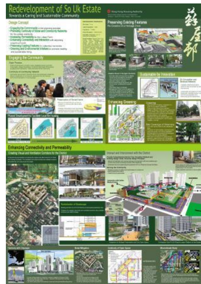
Presentation of Merit Award for Plan/Concept Category - Development and Construction Division of Housing Department –for the design ‘Redevelopment of So Uk Estate’